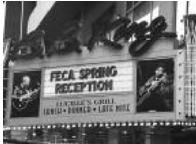
FECA hits the big time on the Marquis of BB King Blues' Club and Grill.