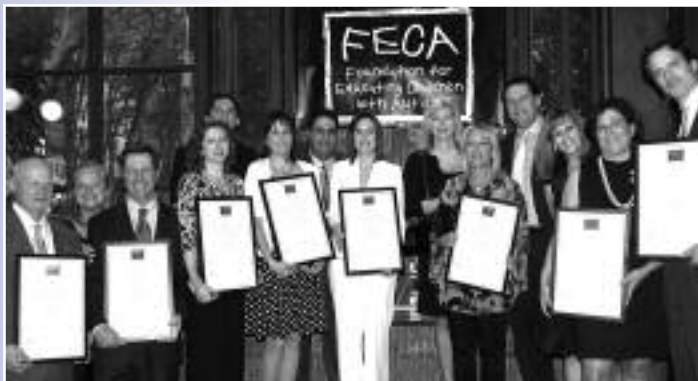
The 2009 FECA "Bullpen of Angels" and their friends