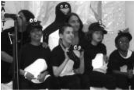
The ensemble cast portrays a typical day in the life of a penguin in Antarctica.

Heading for a possible run on Broadway, actors and directors from DMLC first opened their production of "Tacky the Penguin" on the great white way of Millwood, New York on May 1, 2009. The production was the brainchild of the students of classrooms seven and eight who created the costumes and the sets and played all of the roles. The story follows the adventures of Tacky, a young penguin who marches to the beat of her own drum, or in this case, likes to dance to her own style of music, at times