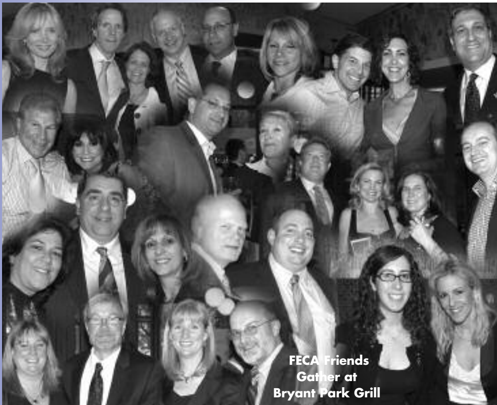
FECA Friends Gather at Bryant Park Grill