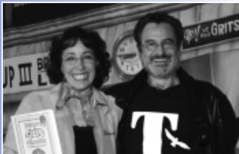
Didi Conn and Barry Pearl pose for a picture, nostalgic of their roles as Frenchie and Doodie