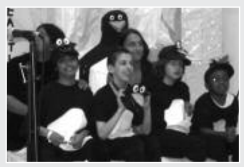
The ensemble cast portrays a typical day in the life of a penguin in Antarctica.

Heading for a possible run on Broadway, actors and directors from DMLC first opened their production of "Tacky the Penguin" on the great white way of Millwood, New York on May 1, 2009. The production was the brainchild of the students of classrooms seven and eight who created the costumes and the sets and played all of the roles. The story follows the adventures of Tacky, a young penguin who marches to the beat of her own drum, or in this case, likes to dance to her own style of music, at times