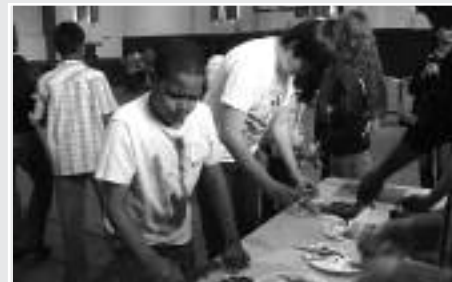
FECA students enjoy finger painting at Pace.

In honor of Autism Awareness Month, the National Panhellenic Council of Pace University held a carnival for the students of the Devereux Millwood Learning Center. On April 9th, all of the staff and students went to the Pace – Pleasantville Campus Gym and were treated to a variety of events. The students participated in activities such as potato sack races, bingo, T-shirt dyeing, painting, ring toss, and other games. The students were able to win prizes of balls, toys, and even goldfish! The Pace students were very interactive in helping facilitate the fun events. The DMLC students were given