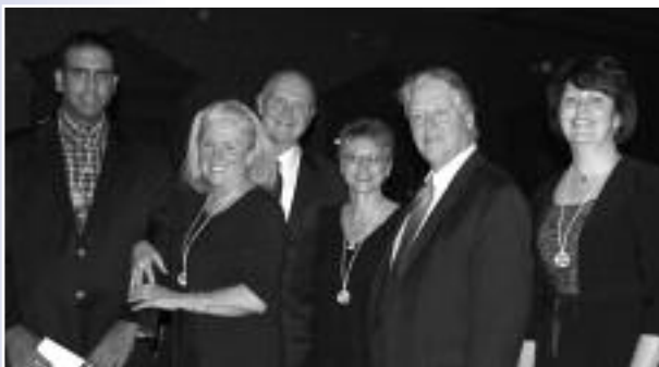
FECA's Friends of the Bethel Nursing & Rehabilitation Center

The theme for the 2009-2010 event calendar framed both the future and honored our past. At our annual fall dinner we honored a beloved staff member and an esteemed employer who have each made a tremendous contribution to the future of our students as